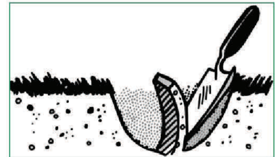
Figure 3. Soil sampling with a trowel.

Push the handle forward, with the spade still in the soil to make a wide opening. Then, as shown in Figure 3, cut a thin slice from the side of the opening that is of uniform thickness, approximately \frac{1}{4} inch thick and 2 inches in width, extending from the top of the ground to the depth of the cut. Collect from several locations. Combine and mix them in a plastic bucket to avoid metal contamination. Take about a pint of the mixed soil and place it in the UGA soil sample bag. Be sure to identify the sample clearly on the bag and the submission form before mailing.