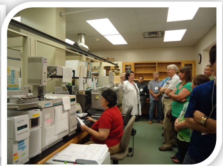
Louisiana State Regulatory Laboratory